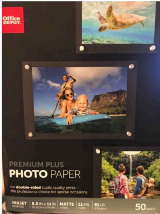
(above) Premium Plus Matte Photo Paper at Office Depot 8.5” x 11” 50 sheets