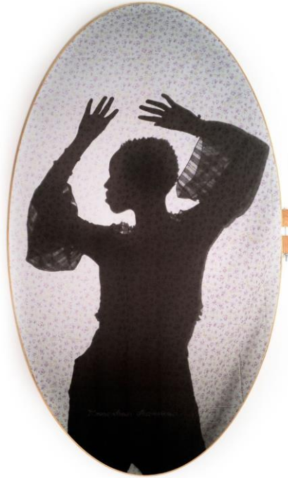
Letitia Huckaby, Sadako , 2020. Pigment print on fabric with embroidery, 70 x 40 x 2 inches

Monroe, LA (2021); Hillard Museum, Lafayette, LA (2021); LSU Museum of Art, Baton Rouge, LA (2021); and at Foto Relevance in conjunction with FotoFest, Houston, TX (2020). Huckaby's work is in the permanent collections of several prestigious museums, including the Smithsonian National Museum of American History, Washington DC; Houston Civic Art Collection, Art at Houston Airport Systems, Houston, TX; Museum of Fine Arts, Houston, TX; Hillard Art Museum, the University of Louisiana at Lafayette, LA; Crystal Bridges Museum of American Art, Bentonville, AR; Library of Congress, Washington, DC; Art Museum of Southeast Texas, Beaumont, TX; Brandywine Workshop in Philadelphia, PA; and the Samella Lewis Contemporary Art Collection at Scripps College in Claremont, CA.