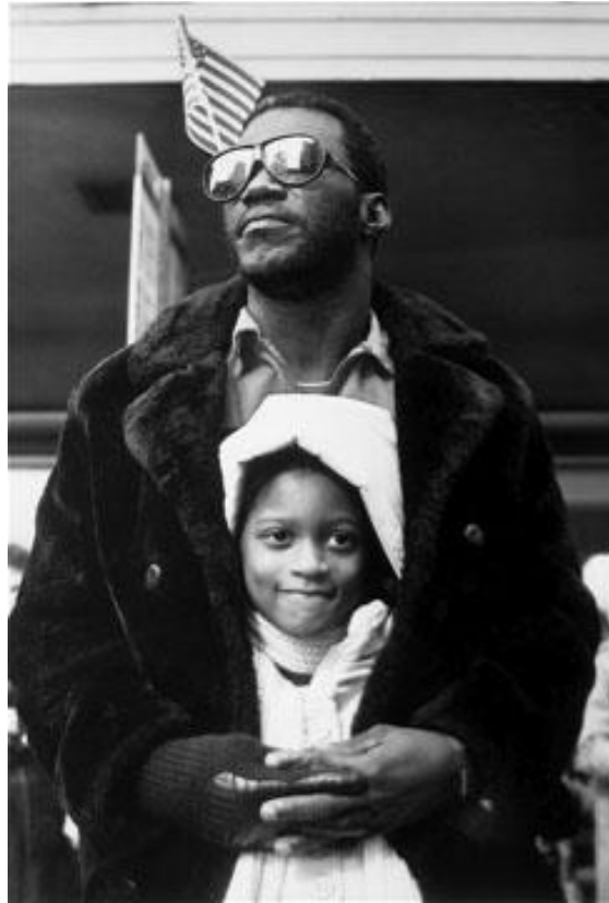
Earlie Hudnall, Jr., The Guardian , 1990 Gelatin silver print.

exists between young and old because there is always continuity between the past and the future. The camera really does not matter – it’s still just a tool. What is important to me is the ability to transform an instant – a moment – into a meaningful, expressive, and profound statement – some personal, some symbolic, and some universal. My photographs are archetypes of my own childhood. They represent a literal transcription of actuality – the equivalent of what I saw or felt. The viewer can accept the image as one’s own and respond emotionally and aesthetically to the captured image."